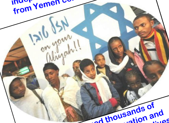
Israel has rescued thousands of Ethiopian Jews from starvation and persecution, offering them better lives.