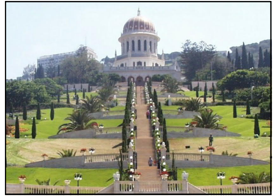
Haifa's Baha'i Temple, international headquarters of the Baha'i faith.