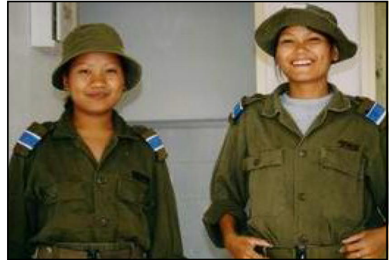
Some 1,000 people from the Bnei Menashe sect immigrated to Israel from India and elsewhere. They descend from the tribe of Menasseh and today are full citizens.