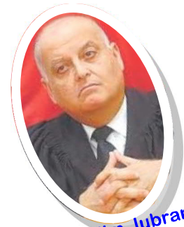
This is Salim Jubran, an Israeli Arab. Since May 2004 he has been a Justice on Israel's Supreme Court. Israeli Arabs serve on other Israeli benches and in Israel's Knesset.

Israel has led progress programs in 31 Black African nations plus Singapore, Thailand, Burma, and the Philippines.