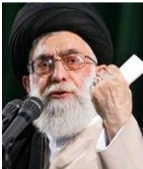
Supreme Leader Ayatollah Ali Khamenei

Remember: No matter how nice the man on the right smiles, the man on the left rules and controls Iran