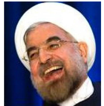
President Hassan Rouhani